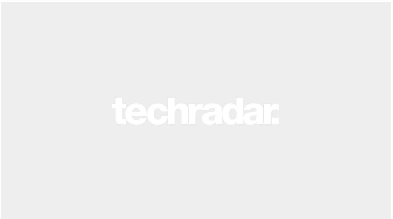
The Sound Burger is back... again

US and Australian prices are yet to be finalized, but the Vestia N°1 (a compact bookshelf model) is £799 per pair, which is around $960 or AU$1,400. Meanwhile, the Vestia N°2 (a "first step" three-way floor-standing model) comes in at £1,799 per pair (around $2,160 or AU$3,160); the Vestia N°3 (the next-level three-way floor-standing model) is £2,399 per pair; the Vestia N°4 (a 3-way floor-standing model which adds two 21cm woofers) is £2,599 per pair; and the Vestia CC (the two-way center channel model for surround sound setups) is going for £449 (around $530 / AU$790).